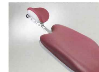
050's Twin-articulating headrest