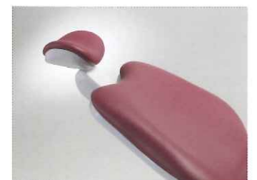
055's Power headrest