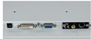
Analogue, DVI, S-Video and CVBS inputs for any video device or PC data feeds