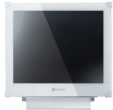
Strong metal design for increased durability