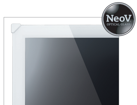
NeoV™ Optical Glass protects against scratches, impacts and other physical damage