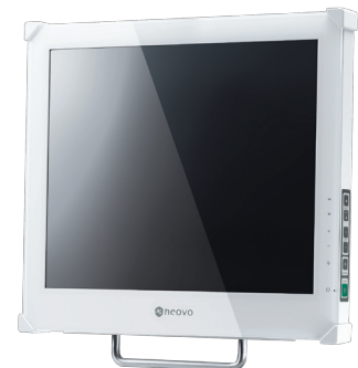
Convenient handle allows for easy movement