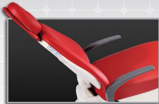
ULTRA THIN BACK