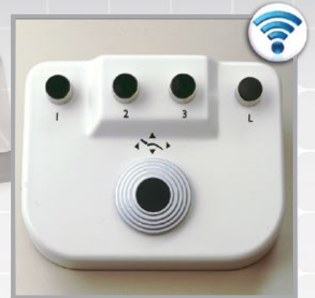
WIRELESS FOOT CONTROLS