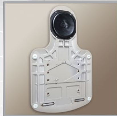
EXCLUSIVE AIR GLIDE