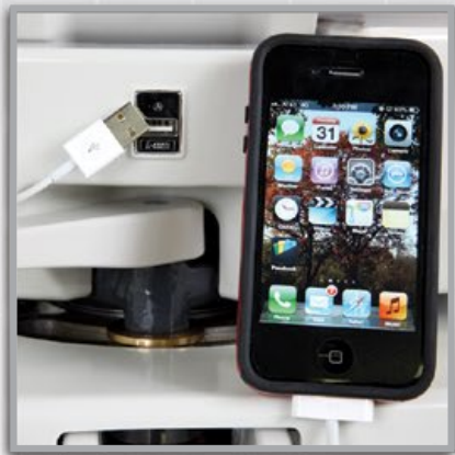
OPTIONAL USB POWER SUPPLY