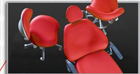
ERGONOMIC BASE PLATE