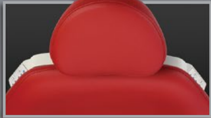
DUAL LOCATION TOUCH PADS WITH DOUBLE ARTICULATING HEADREST