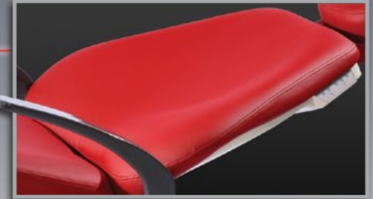
TAPERED NARROW CHAIR DESIGN